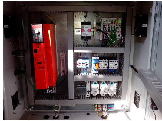
A typical control panel used in our projects